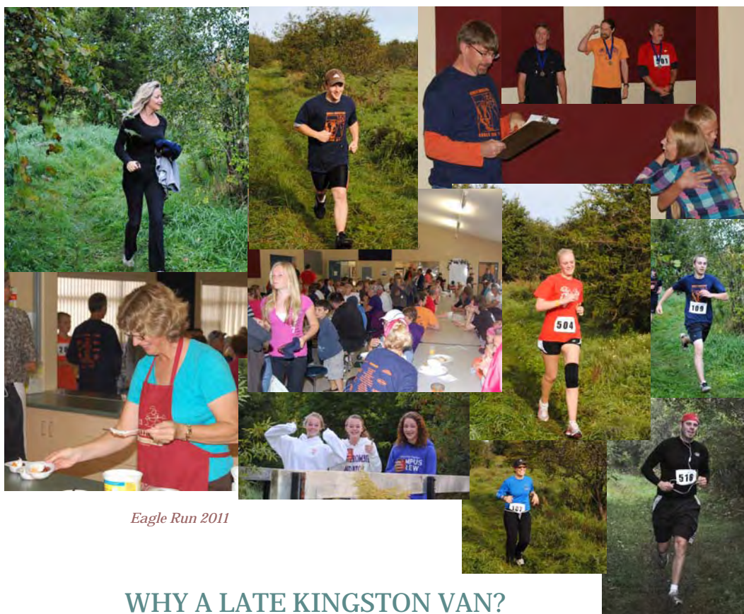
Eagle Run 2011